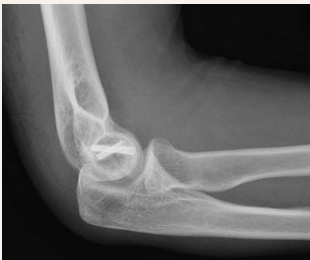
Figure 4 | Post-operative radiograph of the left elbow (lateral view) demonstrating two intraosseous screws providing reduction of the capitellar fragment